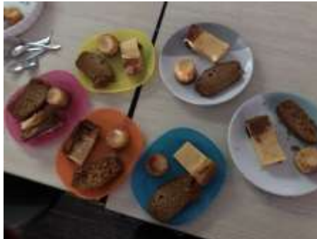
A selection of Cannelés, Far Breton and Pain d'épices