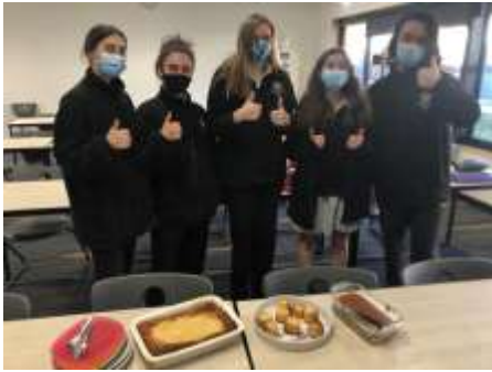
Y12 students enjoying some French delicacies

Each student chose one French region and presented orally. We ended the Term by watching the movie 'Bienvenue chez les Ch'tis/Welcome to the Sticks' a comedy about a southern postman moving to the North of France. The laughs that were heard were a testimony to the comedic value of the film!'