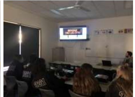
Bienvenue chez les Ch'tis'