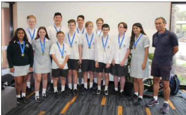
Congratulations to our Year 8 Mixed Baseball team who became State Champions at the Victorian State Schools Sports Association

Awards were also presented to students who participated in our annual Primary School Art competition from local primary schools. A large audience of parents, guardians, grandparents and family members, students and teachers joined together to celebrate an outstanding level of teaching and learning, as well as the artistic achievement and talent of our students.