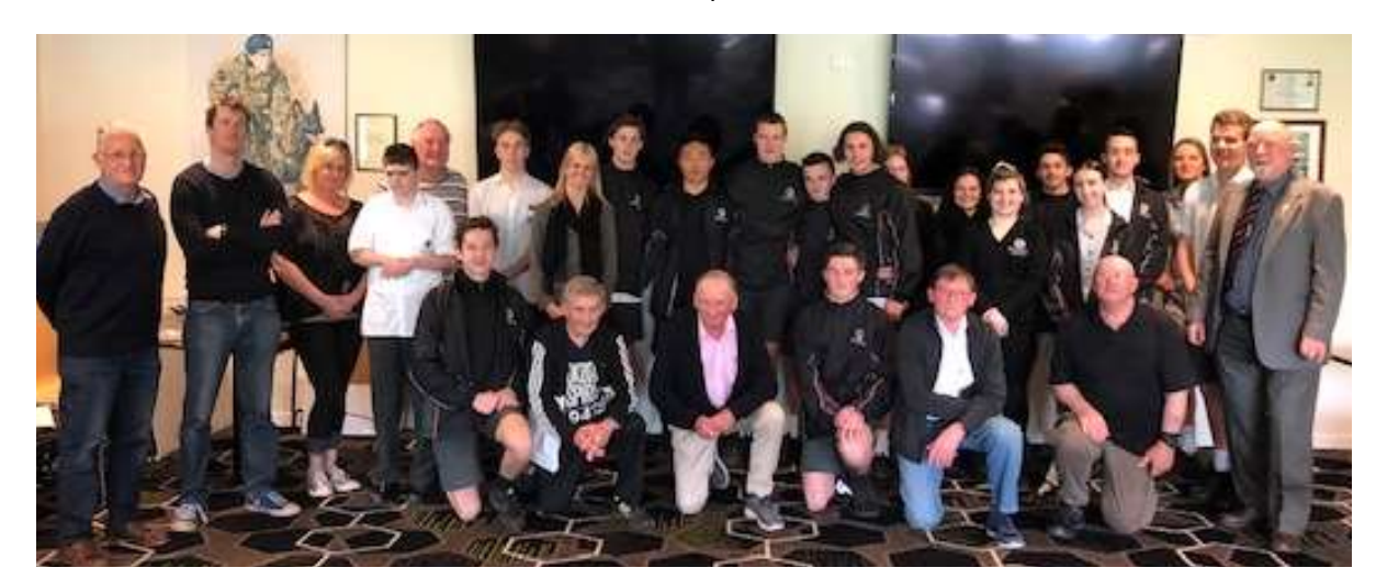
Year 11 VCAL students together local Victorian Vietnam Veterans